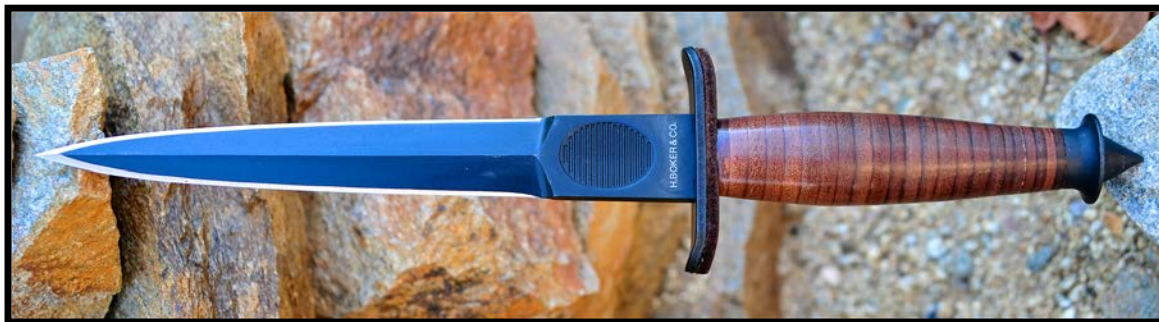
Boker Plus V-42 Replica.

Introduction: This is a brief history of the original V-42 stiletto knife made by W.R. Case & Sons knife company and a review of the new Boker Plus "V-42 Devil's Brigade Knife Replica" Stiletto Knife made by H. Boker & Co. which is sold by the Montana Military Museum and endorsed as an authentic V-42 replica.