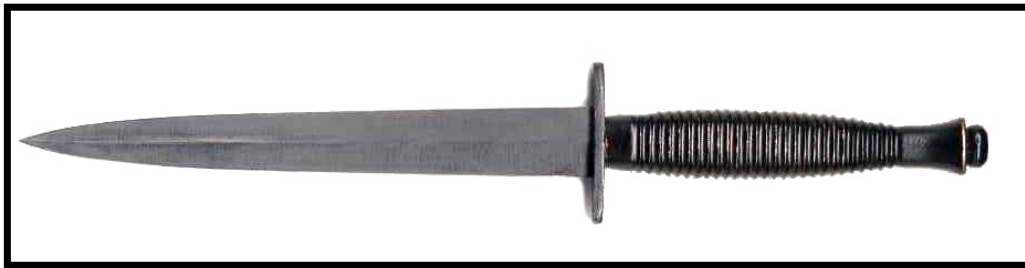
Fairbairn-Sykes Fighting Knife

V-42 Origins & Design: The FSSF Force Knife V-42 was inspired by the Fairbairn-Sykes knife used by earlier British forces and Shanghai Police "Defendu" system under W.E. Fairbairn. The Fairbairn-Sykes knife was made by the Wilkinson Sword Company. The V-42 was modified to improve close-quarter killing--it was not designed for general utility applications--only killing. The V-42 has a narrower blade which makes it easier to fit in-between the ribs and aids in promoting "cleaner cuts" in order to bleed out the enemy faster and more efficiently. The blade also was modified for a thumb imprint to aid in horizontal stabs between ribs. The pommel end was taken from round to pointed to create a "skull crusher" advantage, but the earlier pommel tips were so sharp that the men filed them down to prevent them from gouging their own clothes. The V-42 was developed and modified under the direction of FSSF leader Colonel Robert T. Fredrick who later went on to become the legendary "Last Fighting General." Fredrick himself is worth serious review as he was an incredible leader and lethal soldier who went on deadly night maneuvers behind enemy lines with his men.