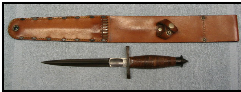
Original V-42 Stiletto by Case & Sons

Introduction: This is a brief history of the original V-42 stiletto knife made by W.R. Case & Sons knife company and a review of the new Boker Plus "V-42 Devil's Brigade Knife Replica" Stiletto Knife made by H. Boker & Co. which is sold by the Montana Military Museum and endorsed as an authentic V-42 replica.